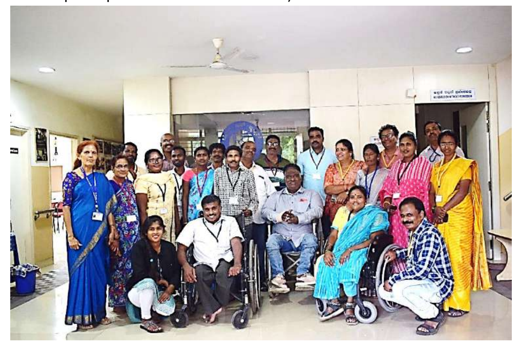
RESOURCE PERSONS' PROFILE (see Annex 3 for the Resource persons' profile)

The training participants included 2 senior coordinators of ADD India and total number of participants was 20 (male:11, female: 9) who belonged to 8 partner organizations (see Annex 2 for the list of participants with the basic details)